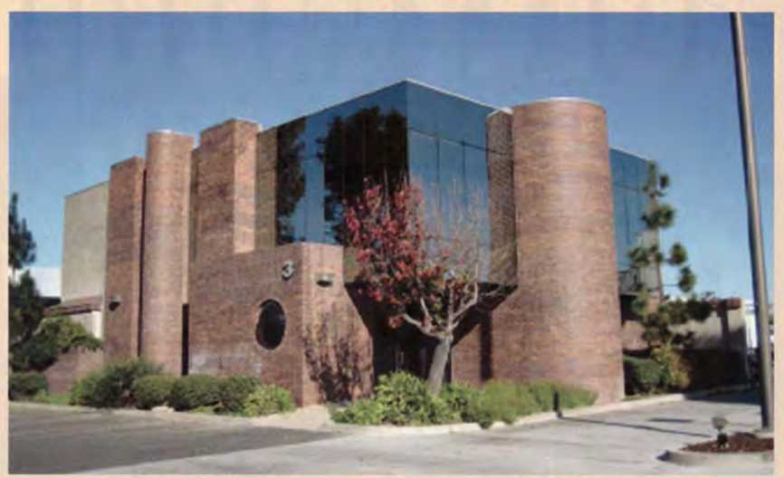
We Praise God for THE NEW FGBMFI HEADQUATERS located in Irvine, California!