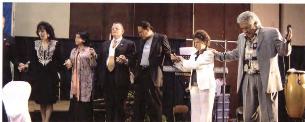
The six main song stylists worship together at the World Convention.