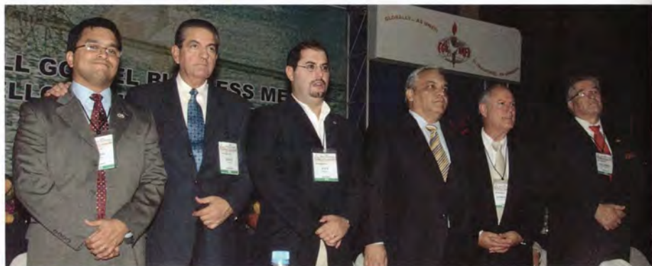
We give thanks to the Panama FGBMFI leadership and their warm hospitality.