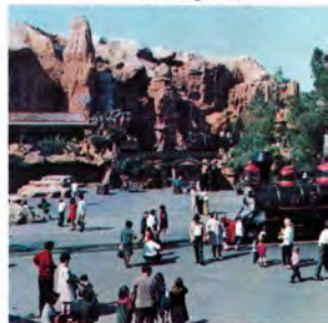
Knott's Berry Farm

All hotels are walking distance to the Convention Center and Disneyland. Door-to-door shuttle bus service is also available. Knott's Berry Farm and other points of interest are within easy driving distance. For hotel locations, see map on Registration Card.