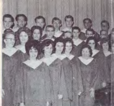
Southwestern Seminary Choir

Youth activities during the convention were handled by Albert D'Arpa, Jr. During the evening youth meetings and at the youth banquet many young people were saved and filled with the blessed Holy Spirit.