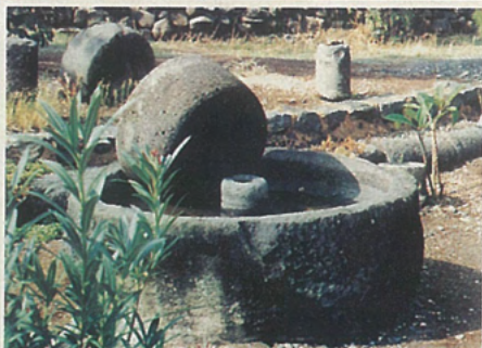
Ancient grinding mill in Israel