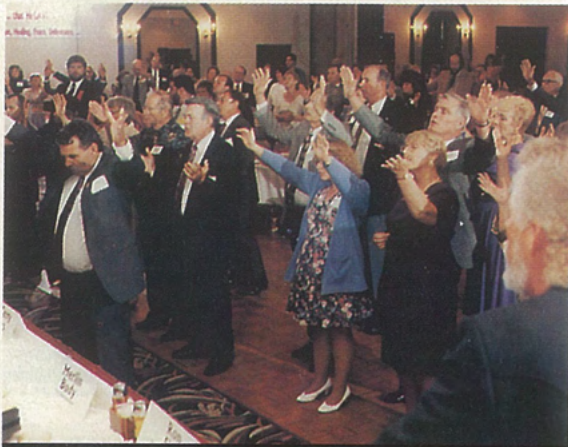
Audience response to one of the many altar calls