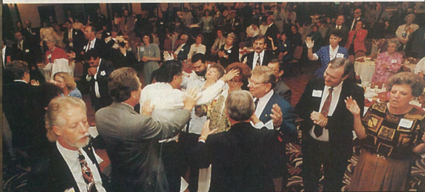
The glory of God visited several hundred people

On September 2nd and 3rd, 1994, the God of Glory visited several hundred people at the Holiday Inn in Oklahoma City, Oklahoma. This was our second annual Oklahoma Convention, featuring "The GLORY of the Lord" and "The ANOINTING of God". The power and presence of God was mani-