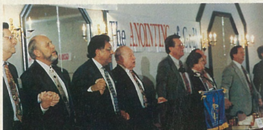
Head Table (left to right)